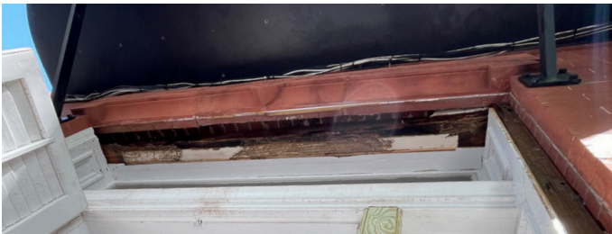
REPLACEMENT OF ROTTEN WINDOW WOOD