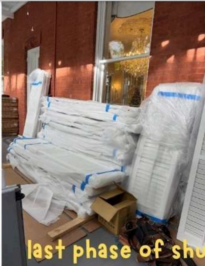
last phase of shutter instillation